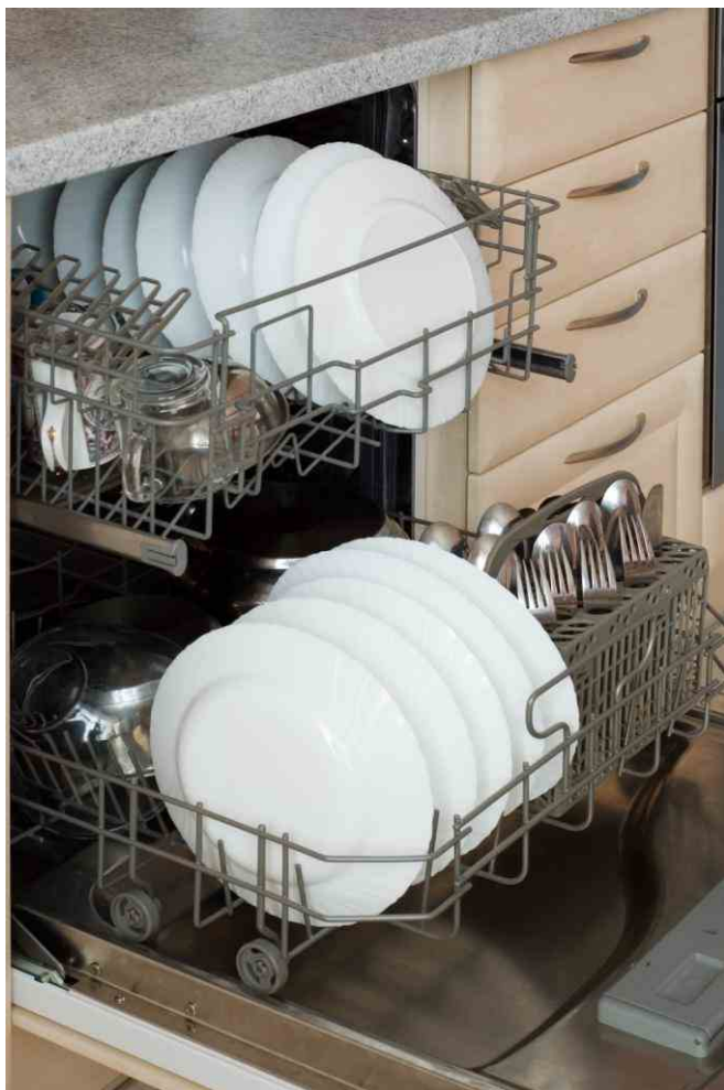
Figure 6. Dishwasher

SS39ET/SS49E/SS59ET Series sensors can monitor the current powering the electromagnets in the pump's motor. If the current is not within its normal range, the logic could also perform overload or motor malfunction detection.