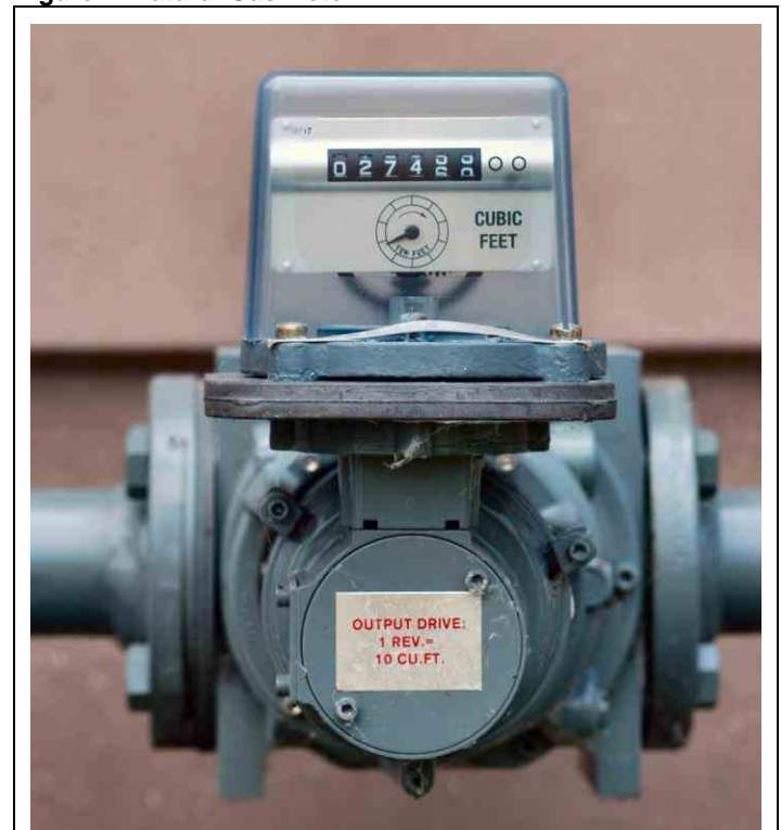
Figure 2. Natural Gas Meter

Install linear Hall-effect sensors in multiple locations inside the meter to detect the abnormal presence of a magnetic field. Send an alarm to the utility company or record this fraudulent activity in memory for processing at a later date.