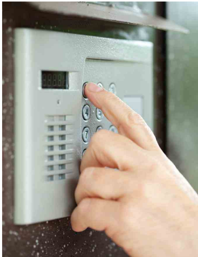
Figure 3. Electronic Locks

Without reproducing the exact magnetic flux pattern, it would be virtually impossible to unlock the system with a single, or even multiple, strong magnets. Tiny Honeywell SS39ET Surface-Mount Linear Hall-effect Sensor ICs would provide the needed sensitivity, output and very small size.