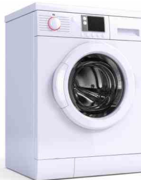
Figure 4. Washing Machine

A linear Hall-effect sensor generates an enhanced control signal for better resolution of the rotor position, which can improve the motor's efficiency.